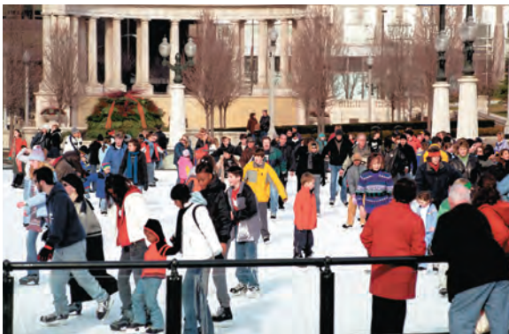
From top: The Chicago Botanic Garden's lovely Japanese Garden; see winter-loving Chilean flamingoes, Amur tigers, otters and Sun bears at the Lincoln Park Zoo; the Millennium Park ice skating rink.

Want a little romance with your winter sightseeing? Bundle up with your beloved and take a horse-drawn carriage ride through downtown Chicago. JC Cutters Ltd. saddles up horses for tours of up to an hour, passing favorite city sights like the lakefront, State Street and Buckingham Fountain. Make a reservation, or just mosey over to the stand at Michigan and Chestnut ($30-$120 plus gratuity, 888-664-6014).